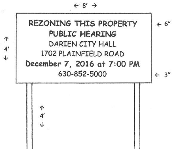
For lots 1 acre or larger