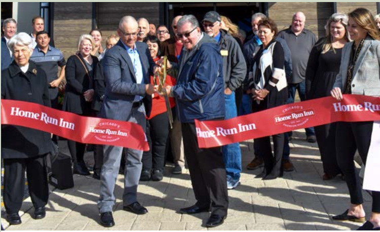
Mayor Joe Marchese joined representatives and staff of Home Run Inn Pizza (7521 Lemont Rd.), and the Darien Chamber of Commerce members for a ribbon cutting and grand re-opening celebration following the restaurant's recent renovations.