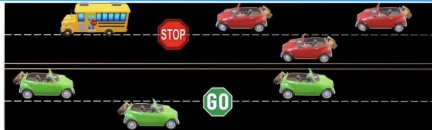
Four-Lane Roadway Without a Median Separation: When a school bus stops to unload passengers, only traffic traveling in the same direction as the bus must stop.