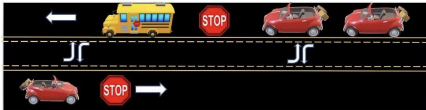
Two-Lane Roadway with Center Turn Lane: When school bus stops to unload passengers, all traffic from both directions must stop.