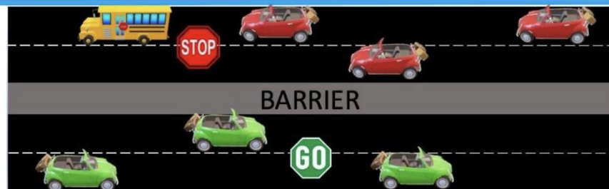
Divided Highway of Four Lanes or More with a Median Separation: When a school bus stops to unload passengers, only traffic traveling in the same direction as the bus must stop.