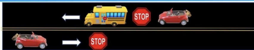
Two-Lane Roadway: When a school bus stops to unload passengers, all traffic from both directions must stop.